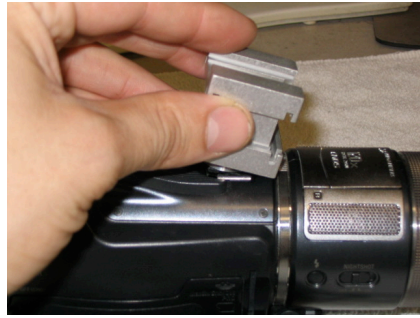
Insert forward edge into the AIS socket.