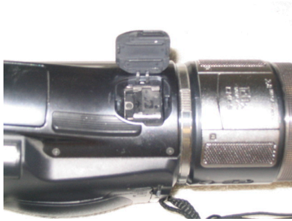
Open the AIS cover